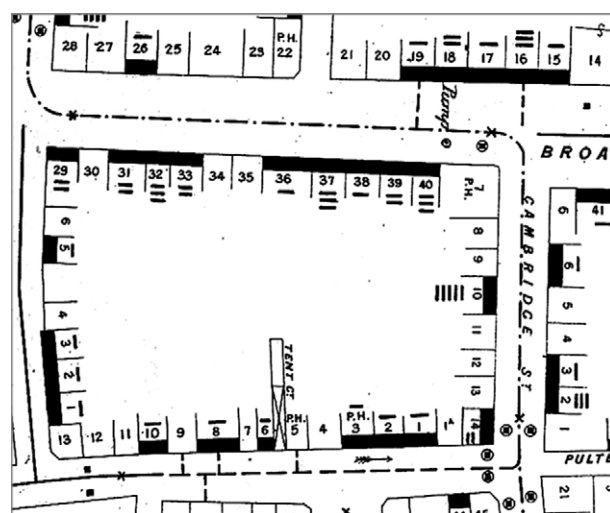
Figure 3: Edmund Cooper's map for the Metropolitan Commission of Sewers, September, 1854

In his report, Cooper added: "Since the outbreak, six men have been employed in these lines of sewers getting up information on this subject, all of whom, I am glad to state, are quite healthy, and entirely free from disease." 12 Thus, he suggested, sewer gases were unlikely to spread cholera.